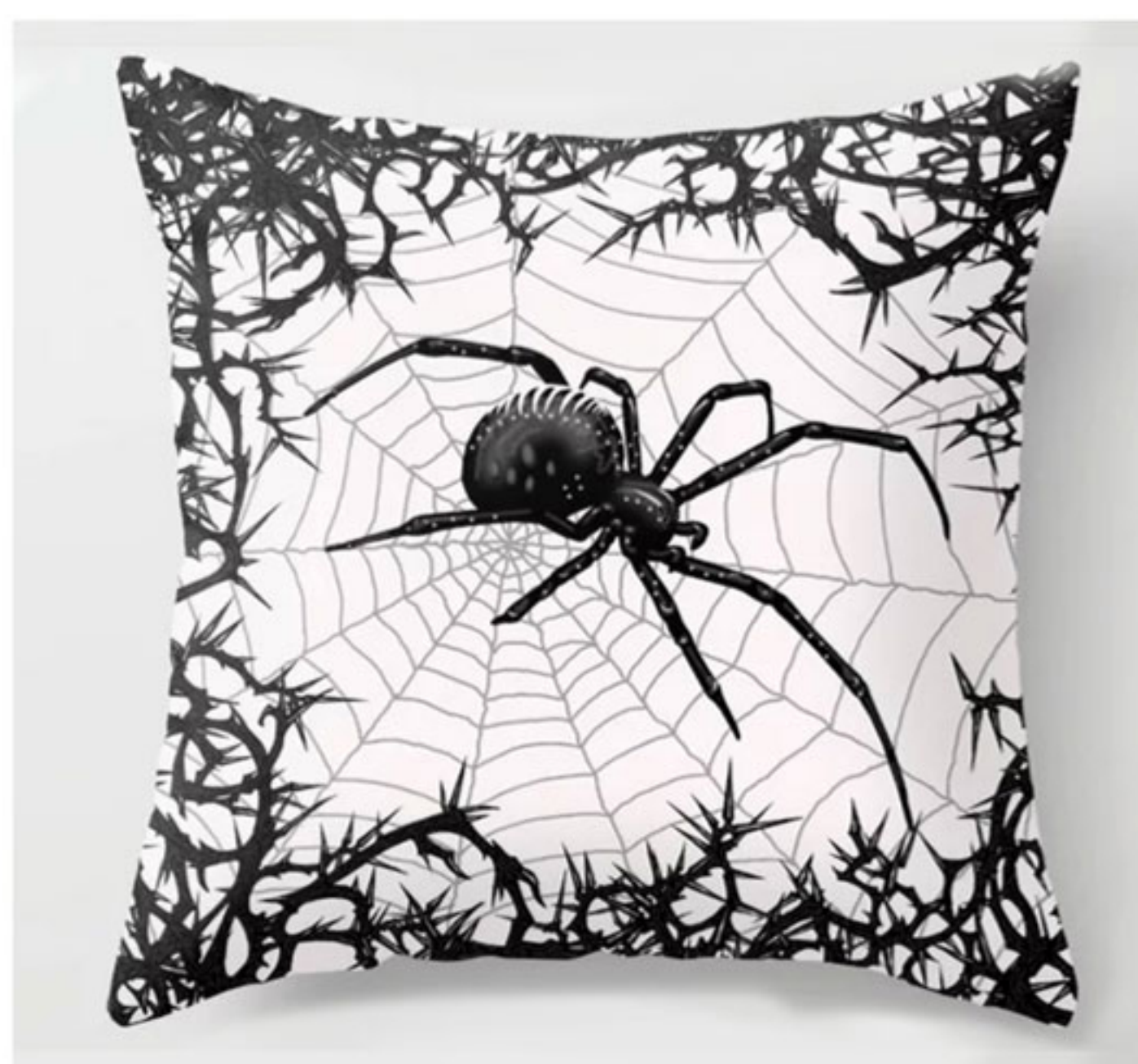
BRIAR WEB BLACK AND WHITE