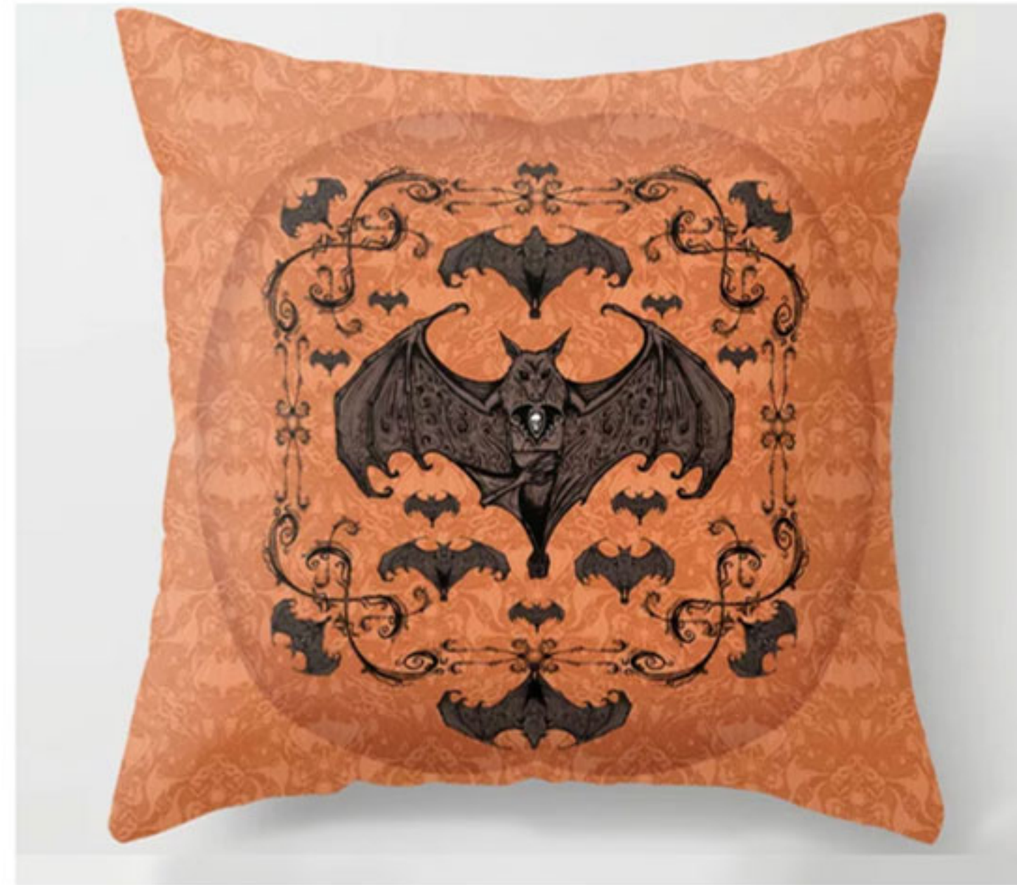
BATS AND FILIGREE HALLOWEEN