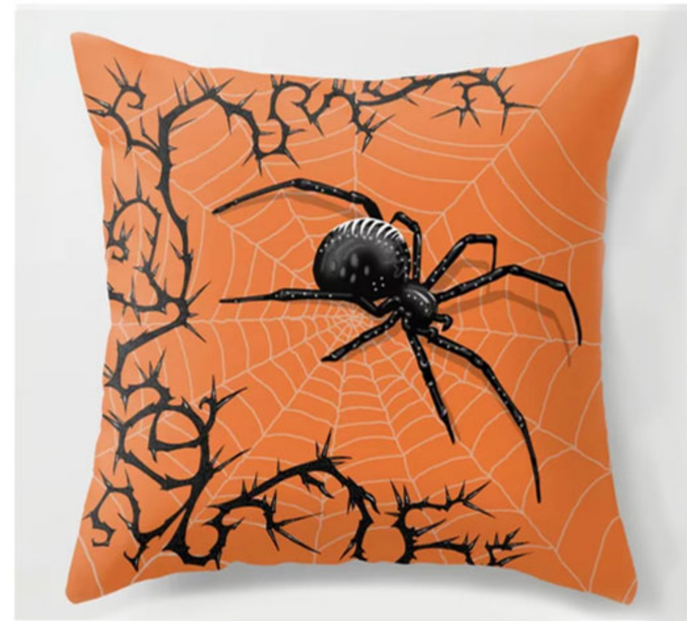
BRIAR WEB HALLOWEEN