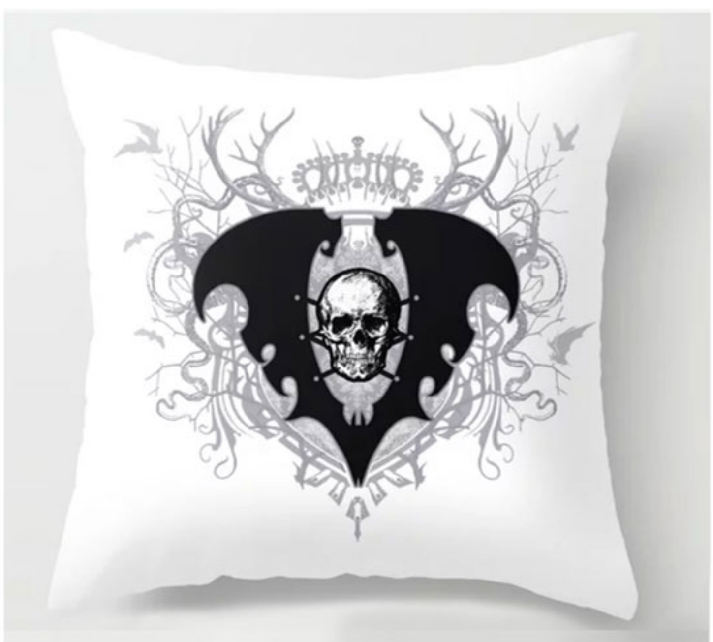
LAIR OF VOLTAIRE CREST WINTER PALACE