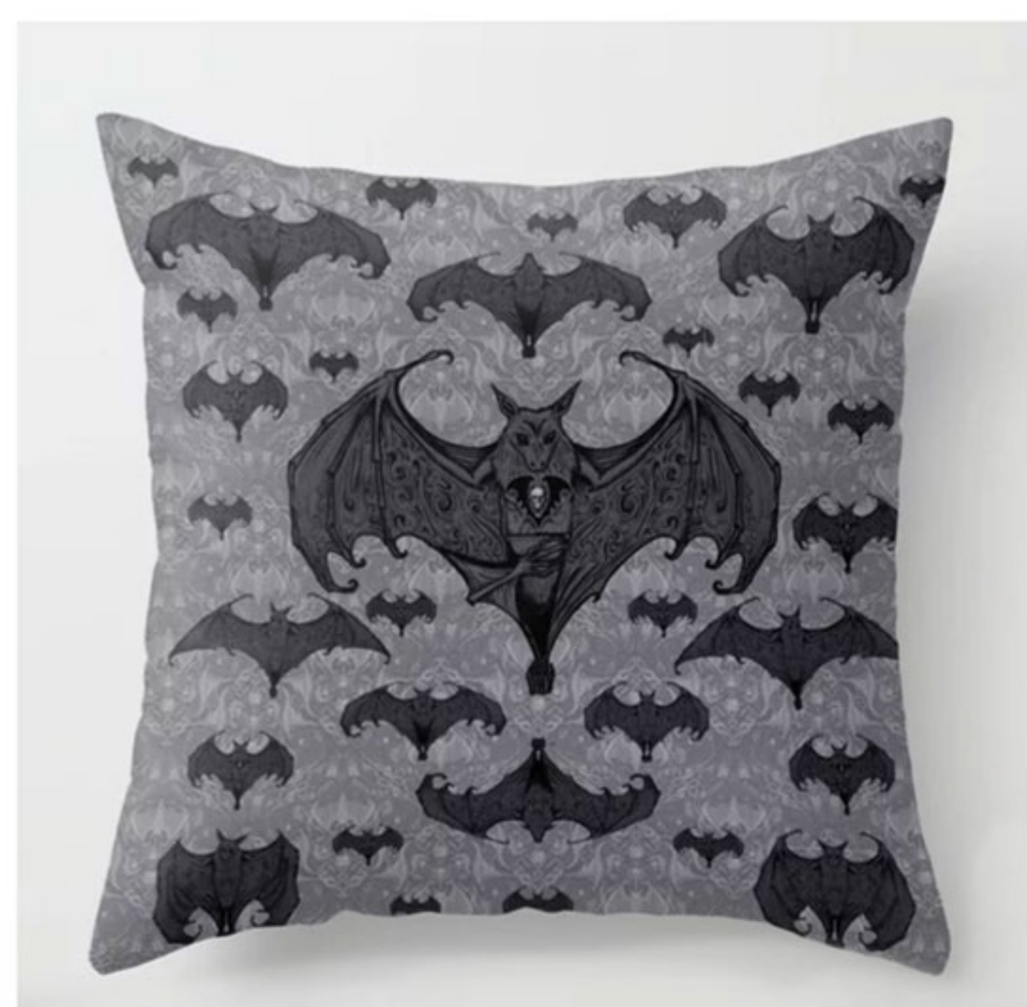
BALINESE BAT HAUNTED MANSION DAMASK