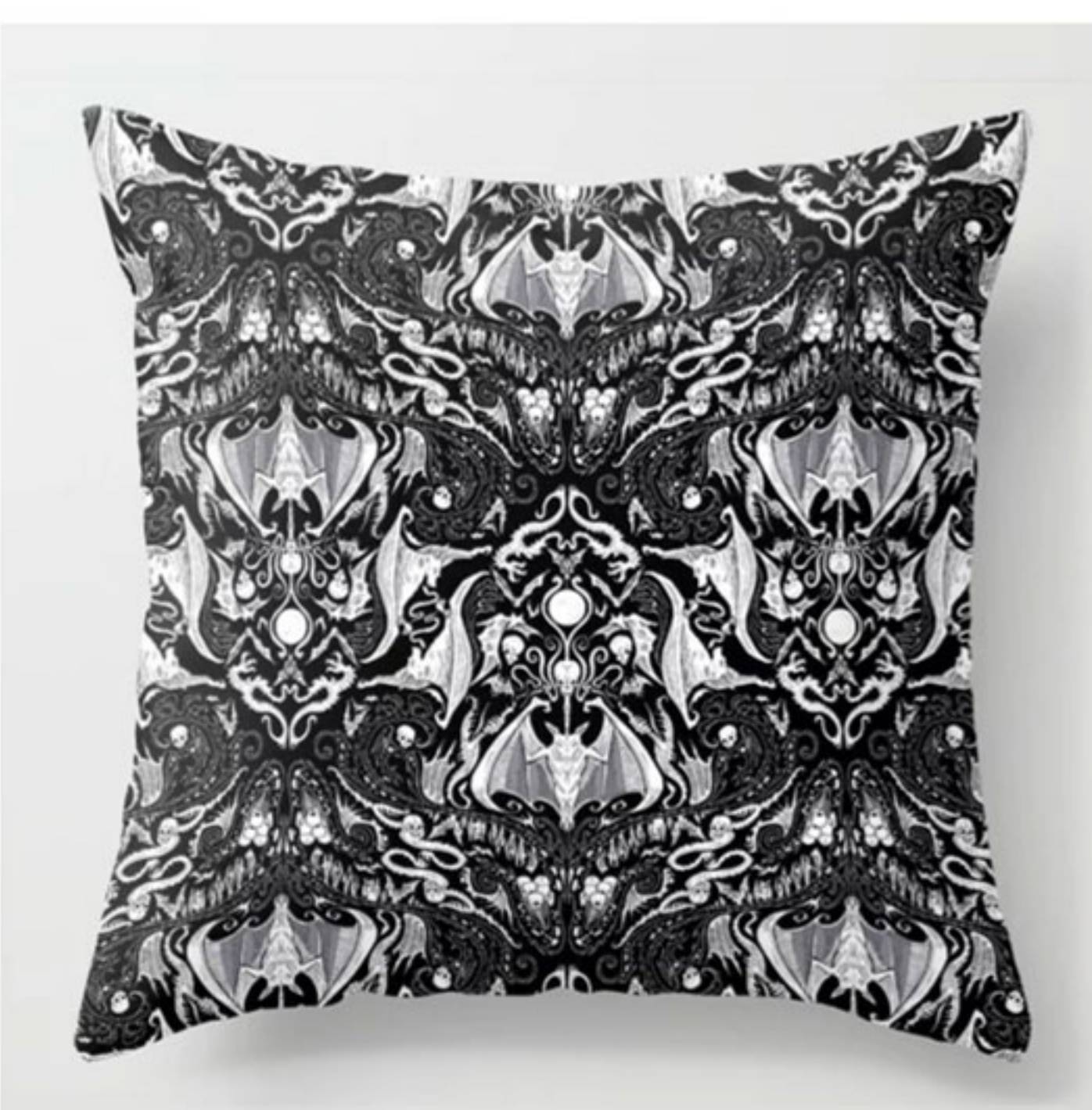
BATS AND BEASTS BLACK AND WHITE