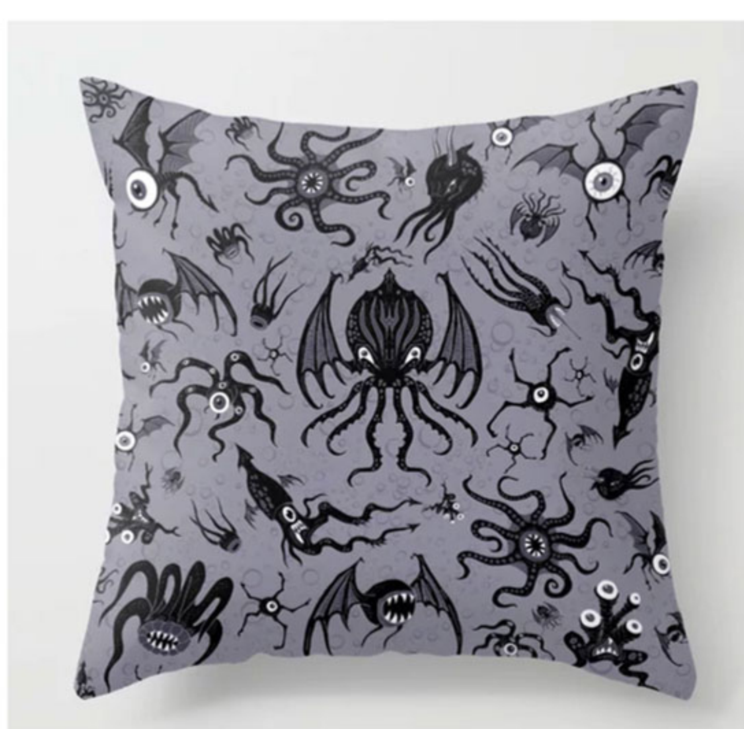
COSMIC CRITTERS TWILIGHT ZONE GRAY