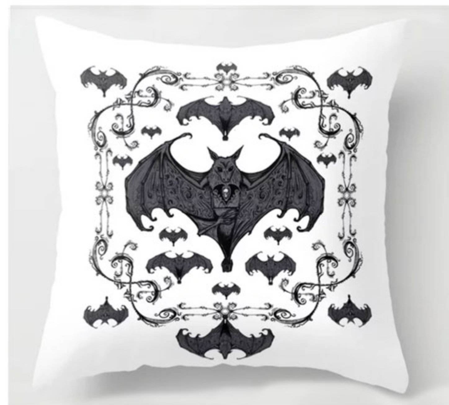
BATS AND FILIGREE BLACK AND WHITE