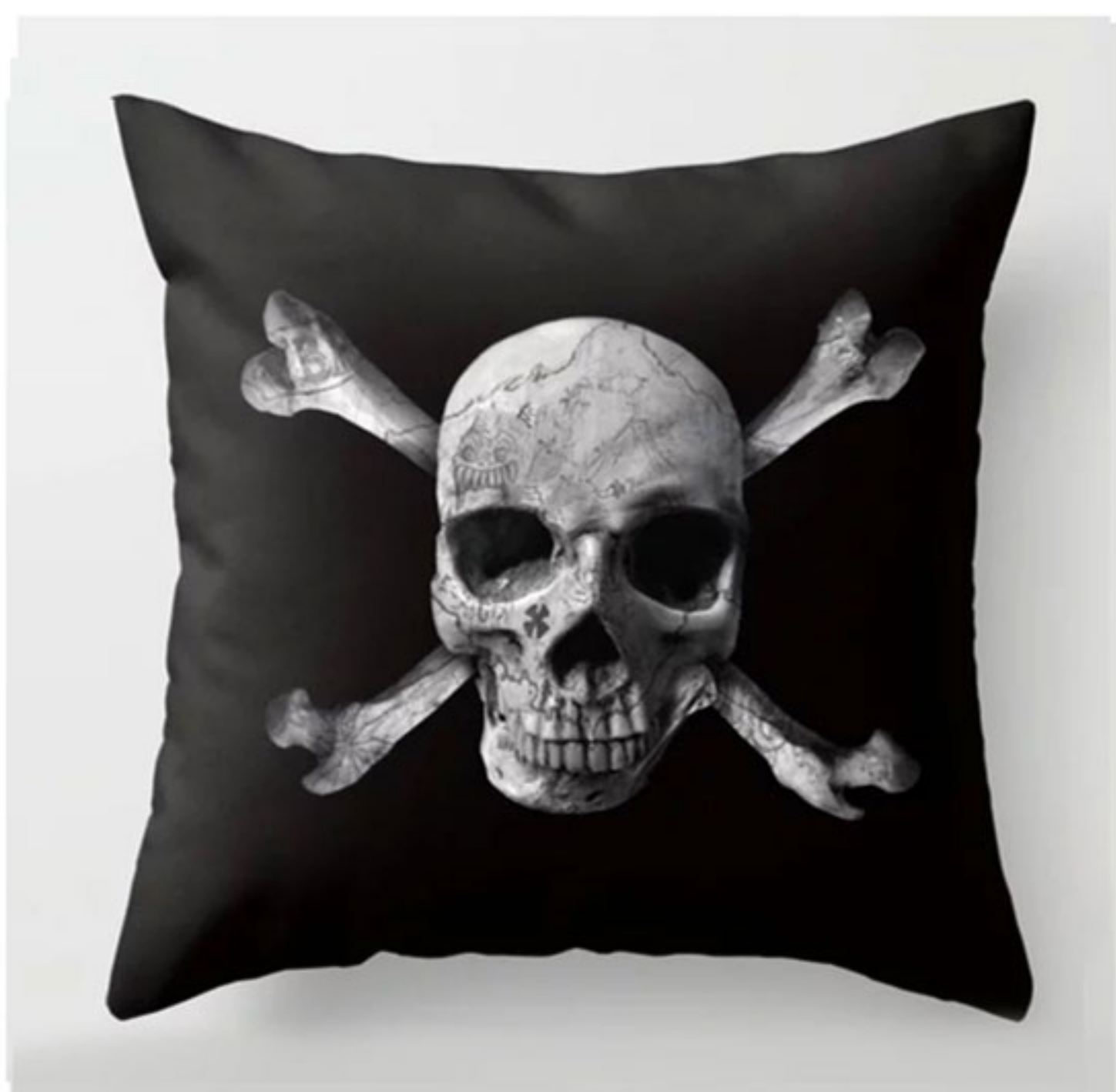
JOLLY ROGER BLACK AND WHITE