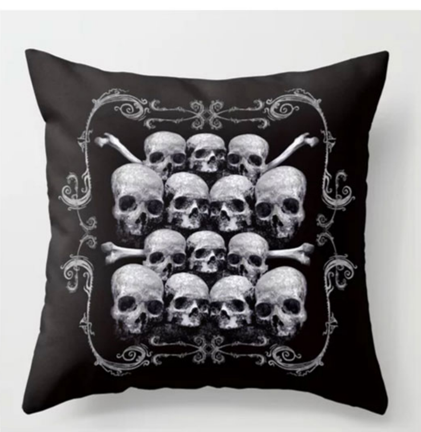
SKULLS AND FILIGREE BLACK AND WHITE