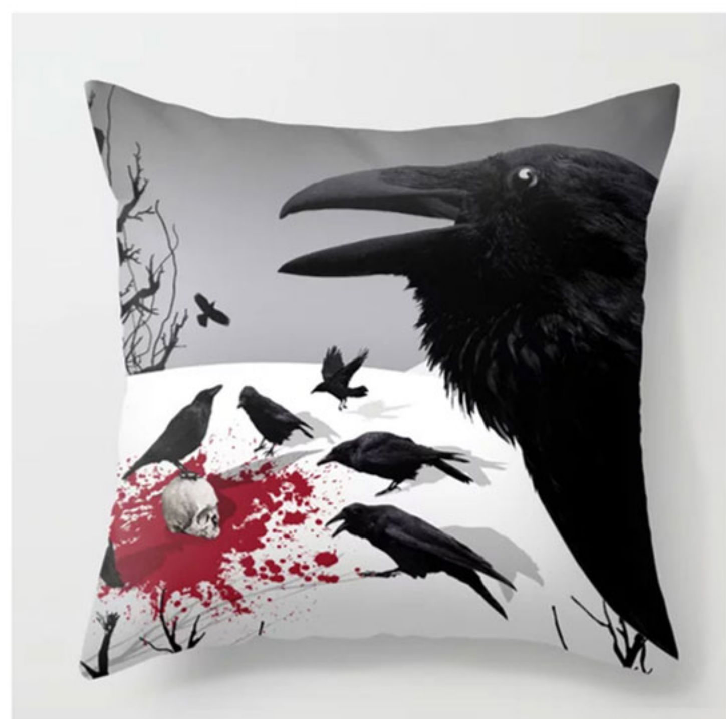
MURDER, SHE CROWED