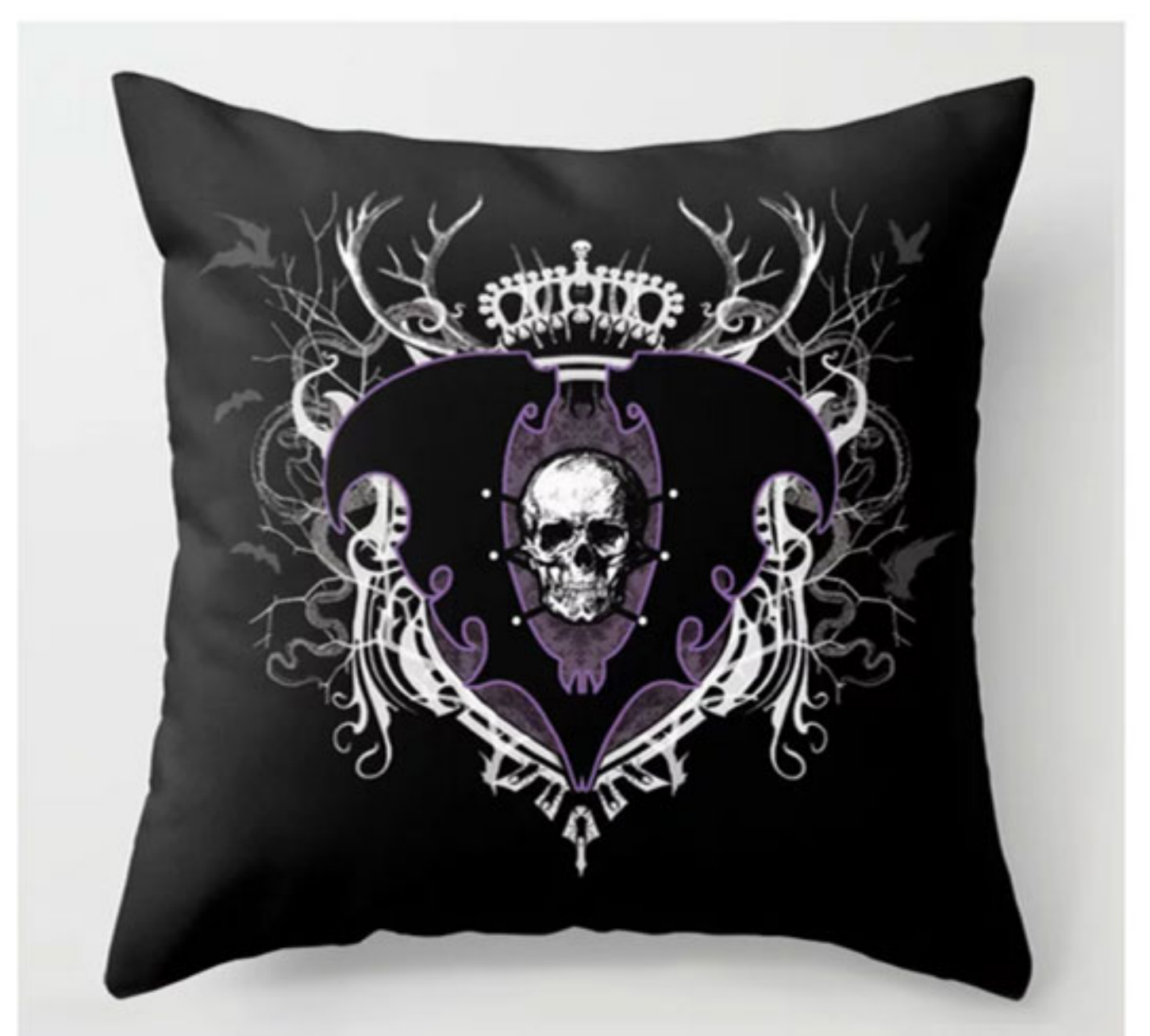
LAIR OF VOLTAIRE CREST