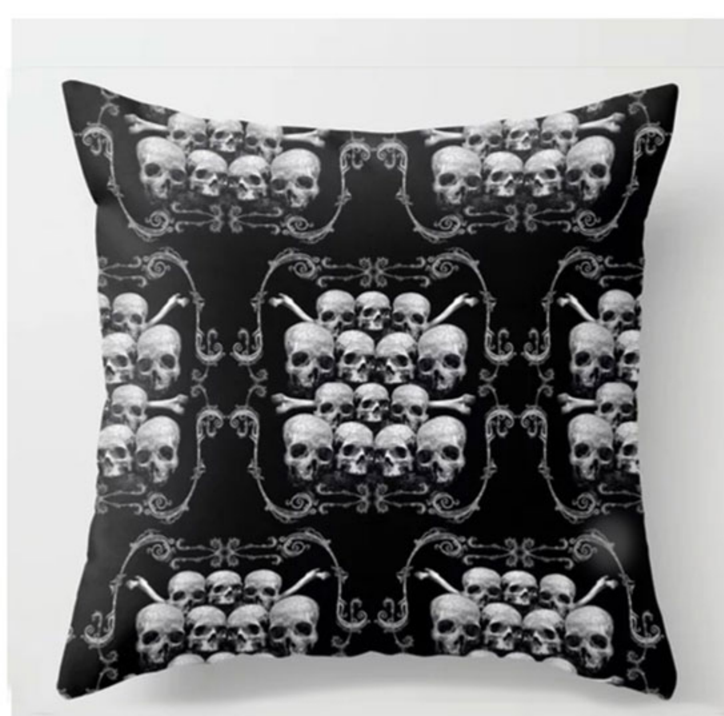
SKULLS AND FILIGREE DAMASK